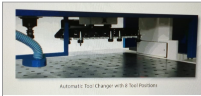
Automatic Tool Changer with 8 Tool Positions