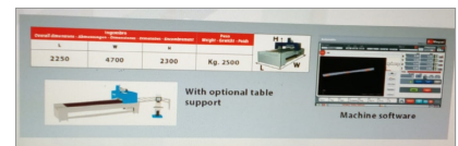
With optional table support Machine software

Sale Office: Office No 9 Gound Floor Sakhi House, Trombay Road, Chembur East, Mumbai - 400071. | Warehouse: Gala No 9, A 6 Block, Padmini Complex Off Kalher Naka, Bhiwandi. | Telephone No.: 91 9769976747 | Email: alptechinternational@gmail.com